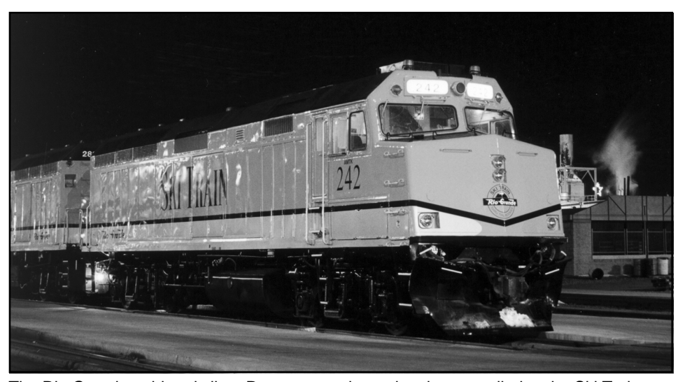
The Rio Grande gold and silver Prospector scheme has been applied to the Ski Train power! This gives the train a uniform appearance. Amtrak F40's 242, 283 and 289 were photographed early on 12/17/00 at Denver Union Station.