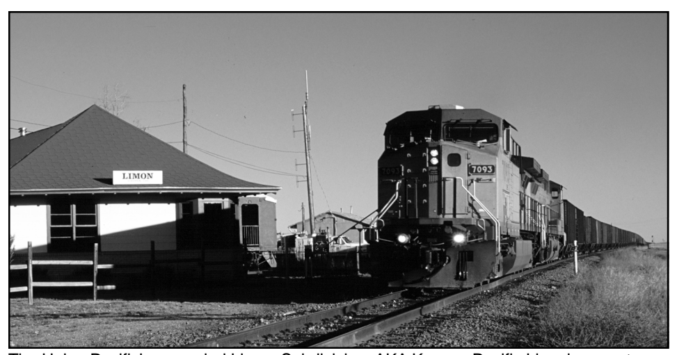
The Union Pacific's upgraded Limon Subdivision, AKA Kansas Pacific Line, in recent years has seen substantial upgrading. Dispatcher signal-controlled sidings have been added at New Byers and Limon. Few trains ran westward in 2000, but that will change in the coming years. UP AC4400CW 7093 and 6496 were westbound on the second coal empty, Chiles, KY, (TVA Shawnee Plant) to Converse Mine, CO, train of 11/15/00, train symbol 2C CSCV 15. Train was passing the Limon depot, now a museum. – 11/20/00 photo © Chip.